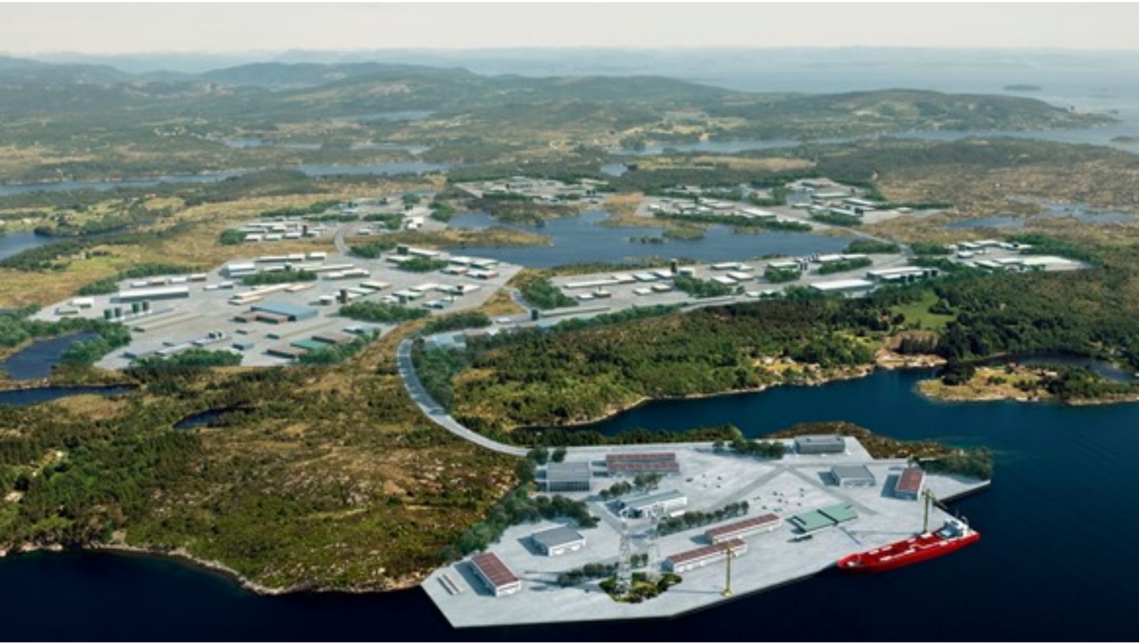
Haugaland Business Park